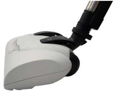
Neck assembly in the OPERATING POSITION