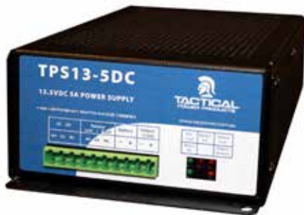
TPS13-5DC 13.5VDC 5A with battery charger