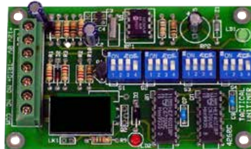
TIM-01- Universal timer 1 sec to 99 days